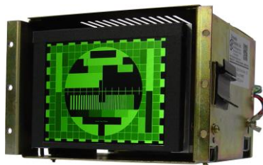
Chassis Provided by Customer

Dynamic Displays, Inc. 1625 Westgate Road – Eau Claire, WI 54703 1-800-793-6862 – Fax: (715) 835-2436 www.dynamicdisplay.com