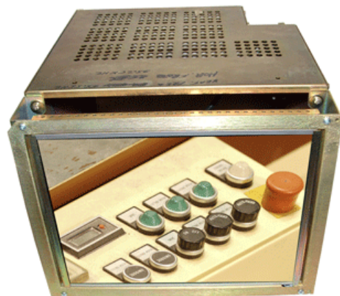
Chassis Provided by Customer