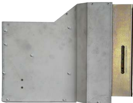
Side View of a 14.1" LCD Open Frame Monitor Mounted on 14" CRT Chassis. Chassis Provided by Customer

Dynamic Displays, Inc. 1625 Westgate Road – Eau Claire, WI 54703 1-800-793-6862 – Fax: (715) 835-2436 www.dynamicdisplay.com